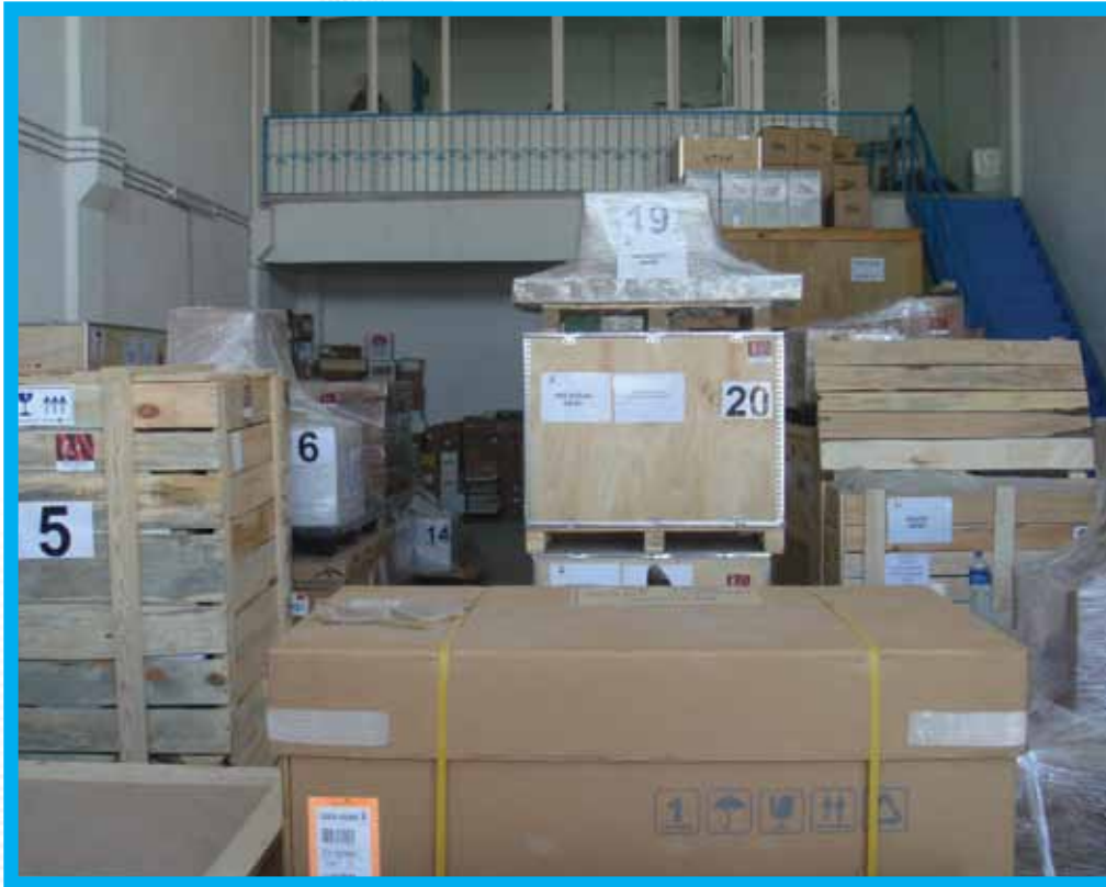
Medical devices and materials provided by our Ministry (August 2009)

After the visit of our Ministry's delegation to Moldova on 1-4 April 2009, by completing a number of consultations between the representatives of the Prime Ministry, our Ministry and the Ministry of Foreign Affairs, medical device and materials needed by Moldova and Gagauzia were determined. The aforementioned medical devices and materials were provided by our Ministry.