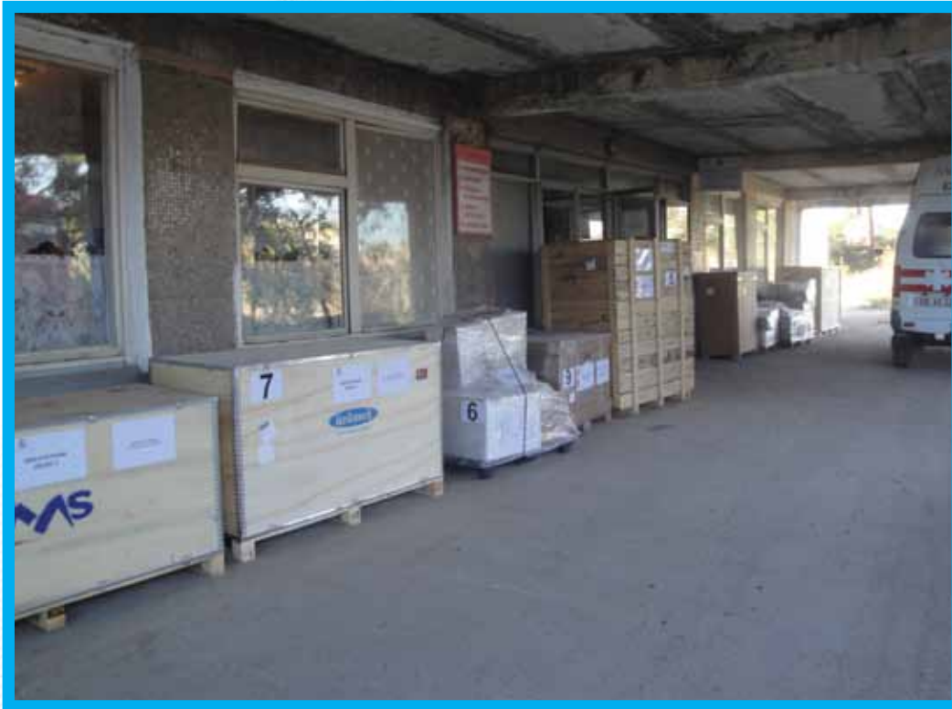
Vulcanesti, (6 October 2009)

On the same day, after the customs formalities had been completed, the goods to be delivered to Vulcanesti were handed over.