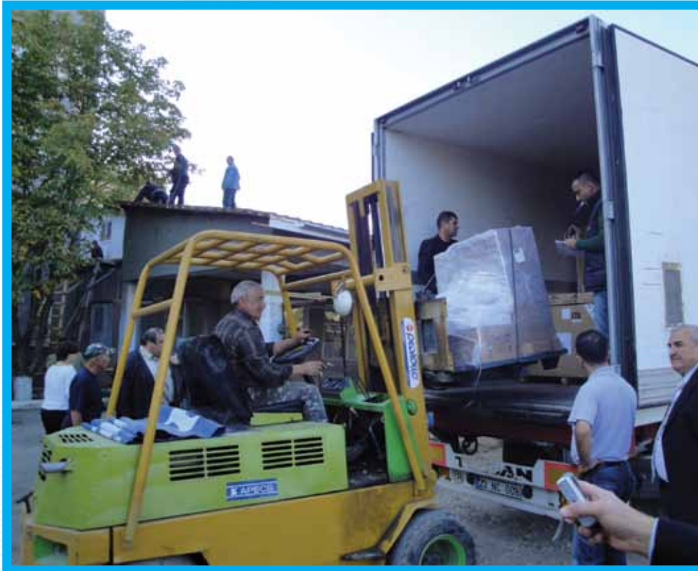
Handing over the goods in Gagauzia (Vulcanesti, 5 October 2009)

MEDICAL DEVICES AND MATERIALS ARRIVED IN THE GAGAUZIA (5 October 2009)