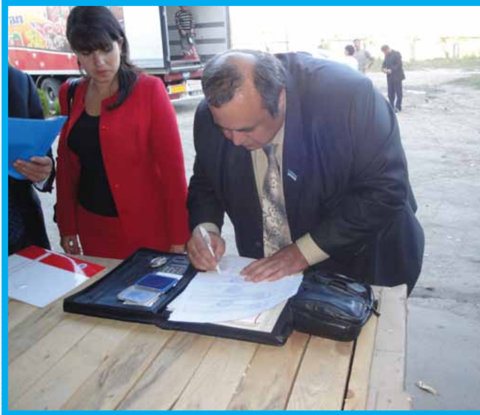
While signing the delivery report (5 October 2009)

One of the technicians accompanying our delegation started to establish the Biochemistry Laboratory in Vulcanesti. The other two technicians, on the other hand, stayed in Comrat and started installations of medical devices.