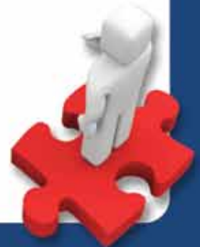
Obstetrics & Gynaecology (Ceadir-Lunga, 6 October 2009)