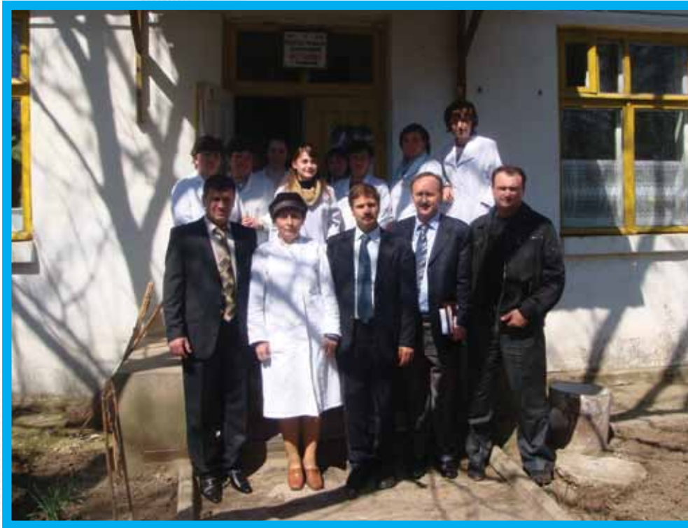
Visit to Çeşmeköy Health Station