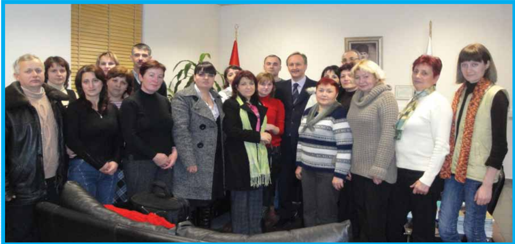
Gagauzia Health Personnel visiting our Ministry (15 December 2009)